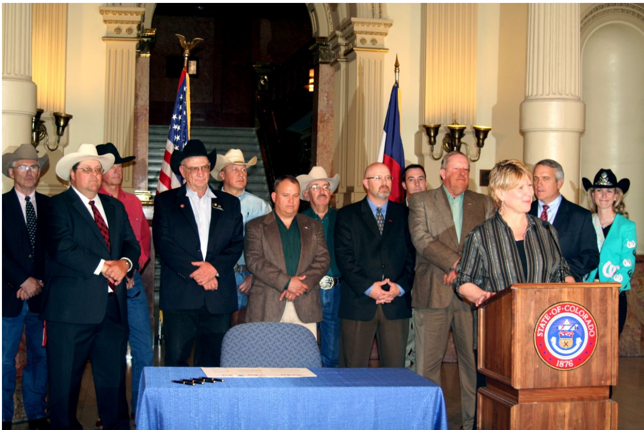
Bill Signing Ceremony